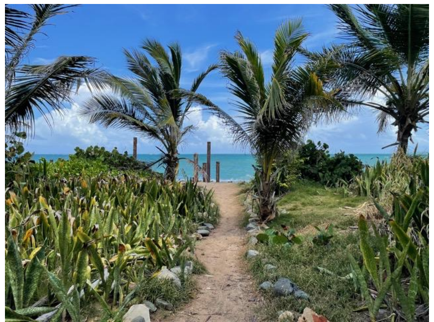
From Puerto Rico one week after completion of the fellowship. This could be you.

Current position(s): Private Practice in Oregon; Part-time Forensic Evalutor, Oregon State Hospital